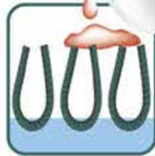
Spills and liquids gradually soak into the fibers